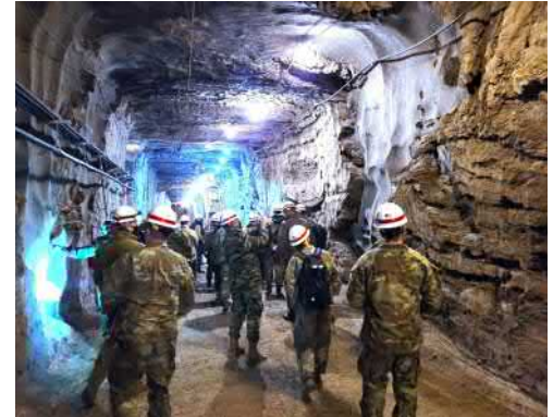
Permafrost Research Tunnel