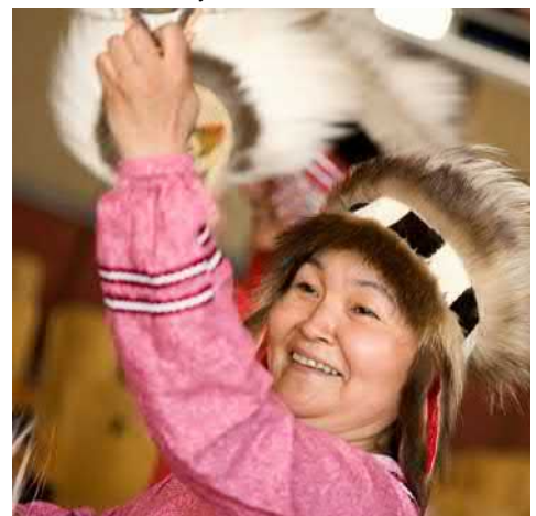
Yupik Dancer at the Alaska Native Heritage Center