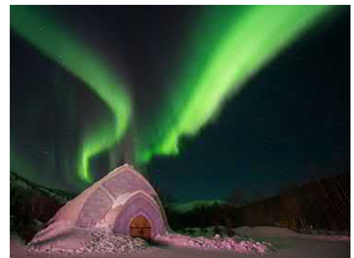
Chena Hot Springs Resort