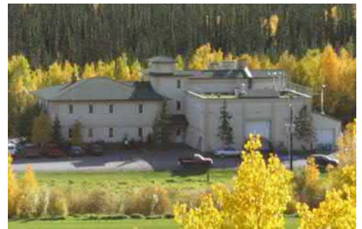
Cold Climate Housing Research Center