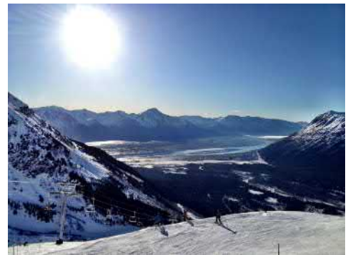
Alyeska Ski Resort