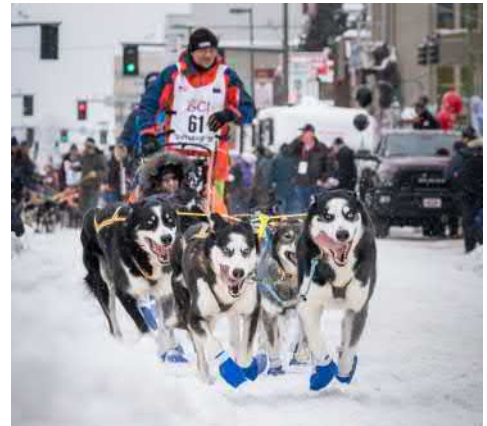
Iditarod Sled Dog Race