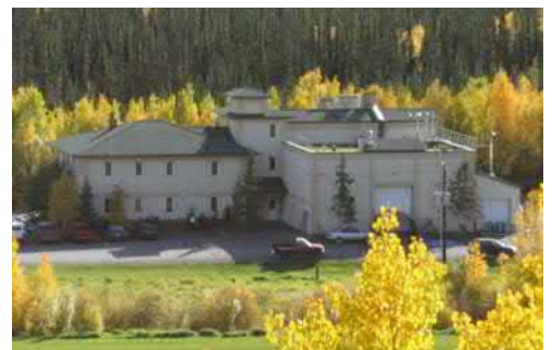
Cold Climate Housing Research Center