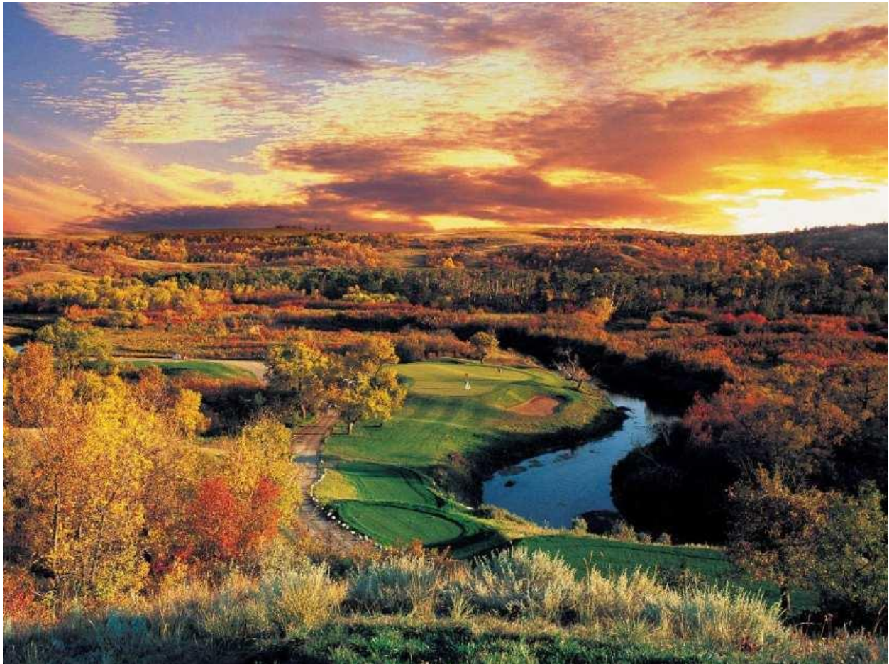
Deer Valley Golf Course's Signature Second Hole