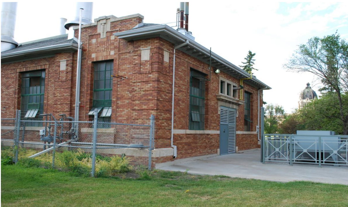
Wascana Powerhouse (Regina Urban Ecology, December 2009)