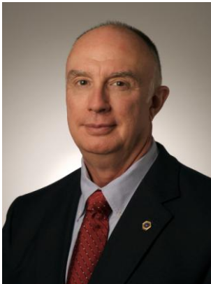
Terry Townsend, P.E., Fellow ASHRAE 2006-07, President American Society of Heating, Refrigerating and Air-Conditioning Engineers

Many buildings that are claimed to be sustainable actually use more energy and natural resources than conventional, building-code constructed facilities. The ASHRAE Technology Awards winners are prime examples of what works and ten different applications that range from a few thousand square feet to over 50 million square feet are presented. The unique applications of conventional equipment in innovative and cost effective manners will provide information for future consideration for building owners, operation and maintenance personnel, technicians and design team members.